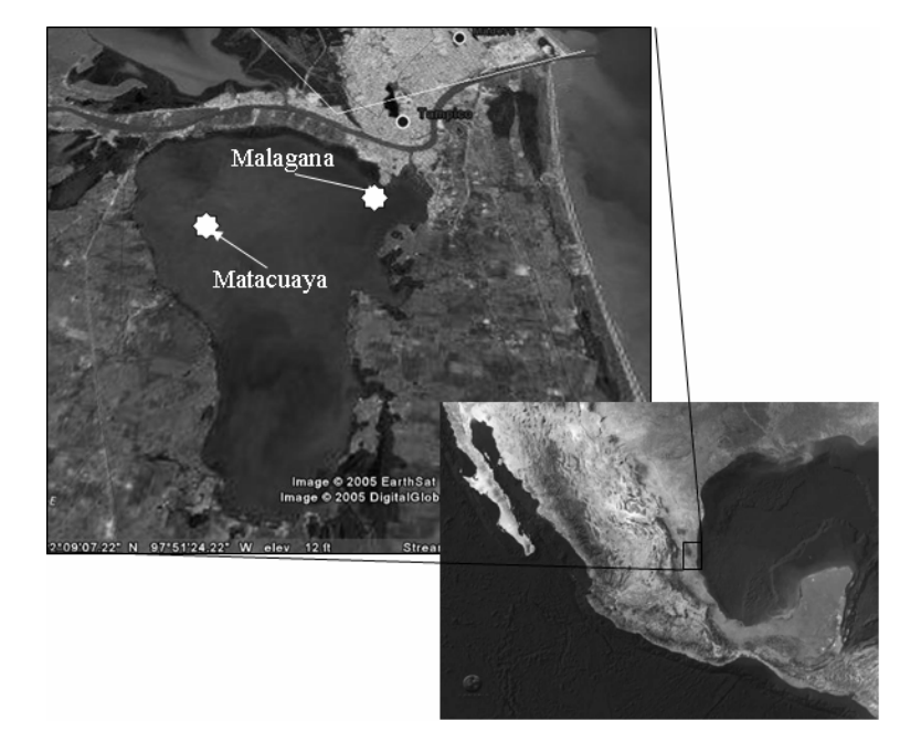
Figure 1. Sampling sites at Pueblo Viejo Lagoon, Veracruz, Mexico.

(Fig. 1). Oyster beds are managed and commercially exploited to some extent at both localities, supporting the two main oyster beds of the lagoon. No environmental data were recorded during sampling; therefore data relating to the Malagana station were obtained Oceanography station from the (OS), corresponding to the period 1996 and 1997 and for the Matacuaya station, data from the (Comision Commission National Water Nacional del Agua, CNA) taken during 2002 were used (Table 1). Table 2 presents sediment quality data for Malagana, over the period 1996-1997 (OS, personal communication).