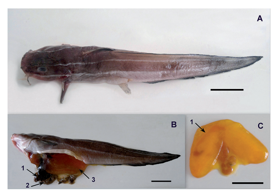
Fig. 2. A. Specimen female of Plotosus lineatus (ref. 2289 M.S.L.) captured off the Syrian coast. scale bar = 20 mm. B. Mature female (ref. 2289 M.S.L.) exhibiting the liver (1), the stomach (2), and the mature ovaries (3). scale bar = 20 mm. C. Mature ovaries removed from the same specimen containing yellow yolked oocytes (1). scale bar = 20mm.

DOGDU et al. , (2016). Such captures suggest that the species is at present successfully established in the Syrian marine waters, and consistent with fishermen and divers who locally sighted schools of the species. Additionally, these four captured specimen were mature females which exhibited large ovaries containing fully yolked oocytes. Some of them were removed from the ovaries and their consistence suggests that they were probably ready to be ovulated (Fig. 2 B, C). Recently, in the wake of local ecological knowledge, Syrian fishermen reported a new capture of 20 specimens of Plotosus lineatus , at least, caught on 07 July 2017 in a single bottom cage, north the city of Latakia by 35°36′ N and 35°45′ E). Such pattern confirms that the species found favourable environmental conditions to reproduce in Syrian marine waters, and concomitantly, the occurrence of a viable population remains a suitable hypothesis.