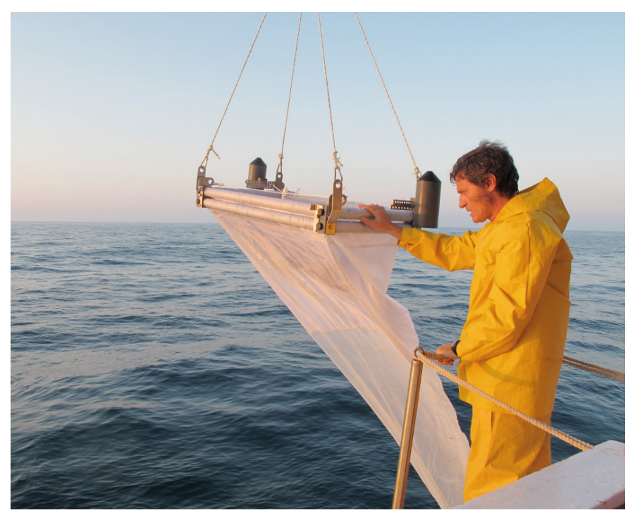
The author, on board of the ship Urania, in a scientific cruise (2013).