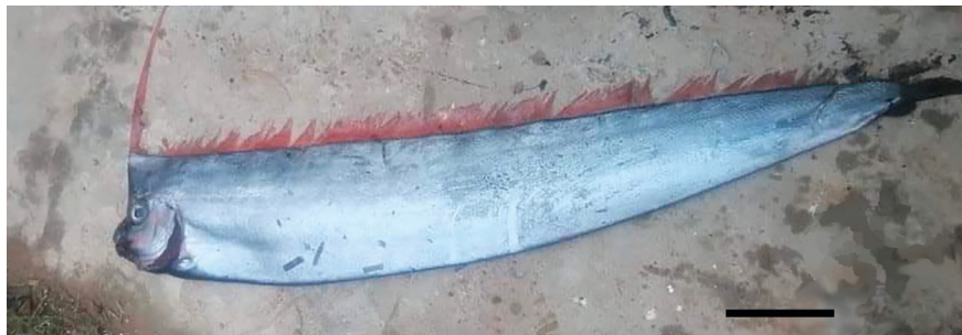
Fig. 1 - Map of the Algerian coast indicating the capture sites of Lophotus lacepede . 1. Off Tipasa (see BACHOUCHE et al. , 2016). 2. Off Cape Falcon, 35 km east to Oran (this study).

The present specimen of L. lacepede was captured on 07 December 2020, by hand line of 15 metres long supporting 15 hooks baited with cuttlefish Sepia officinalis (Linnaeus, 1758). The handline was spread at depth 10-15