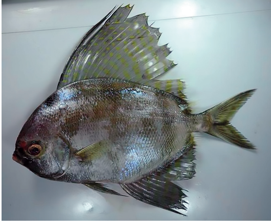
Fig. 2 - Velifer hypselopterus , 430 mm total length collected from the coast of Al-Askhara City, Arabian Sea coast of Oman.

The specimen of V. hypselopterus is identical based on the description of this species given by RANDALL (1995) and HOESE et al. (2006) (Fig. 2).