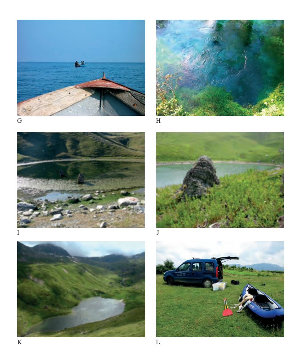
Fig. 2 continued. G, the deep lake Ohrid at Pogradec; H, spring of Syr I Kalter (Delvine District); I, Karstic lake at Hapave, mount Korab; J, alpine lake Karanicola (Sharr massif); K, alpine lake Bogovina (Sharr massif); L, equipment for the sample collection.