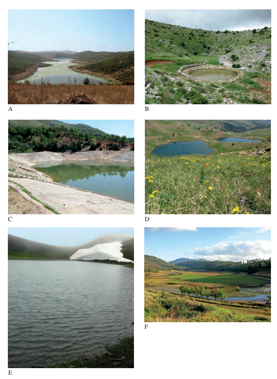
Fig. 2 examples of water bodies of Albania and Macedonia. A, lake Dega (karstic), Dumre area; B, artificial water collection at Progonat highlands (1,350 m asl); C, artificial water collection at Jahl coastal site (Ionian coast, 280 m asl); D, alpine lakes at Valamare mountain (more than 2,000 m asl); E, alpine lake Gijstova on mount Gramoz (2,365 m asl); F, natural watershed Sheleguri (1,110 m asl) in the Gramshi area.