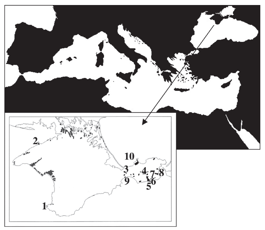
Fig. 2 Crimea map with the indication of salt lakes. Numbers indicate the lakes considered in the present study: 1, Khersonesskoe; 2, Bakalskoe; 3, Achi; 4, Marphovskoe; 5, Koyashskoe; 6, Kirkoyashskoe; 7, Shimakhanskoe; 8, Tobechikskoe; 9, Feodosijskoe; 10, Aktashskoe.

A group of 10 lakes have been selected as a preliminary representation of the hypersaline habitats present in the Crimea (116, according to FEDCHENKO, 1870) (Fig. 2; Tab. 1). The 10 selected lakes were repeatedly visited, in different seasons of a 5 years period (2002-2006), to obtain data as reliable as possible.