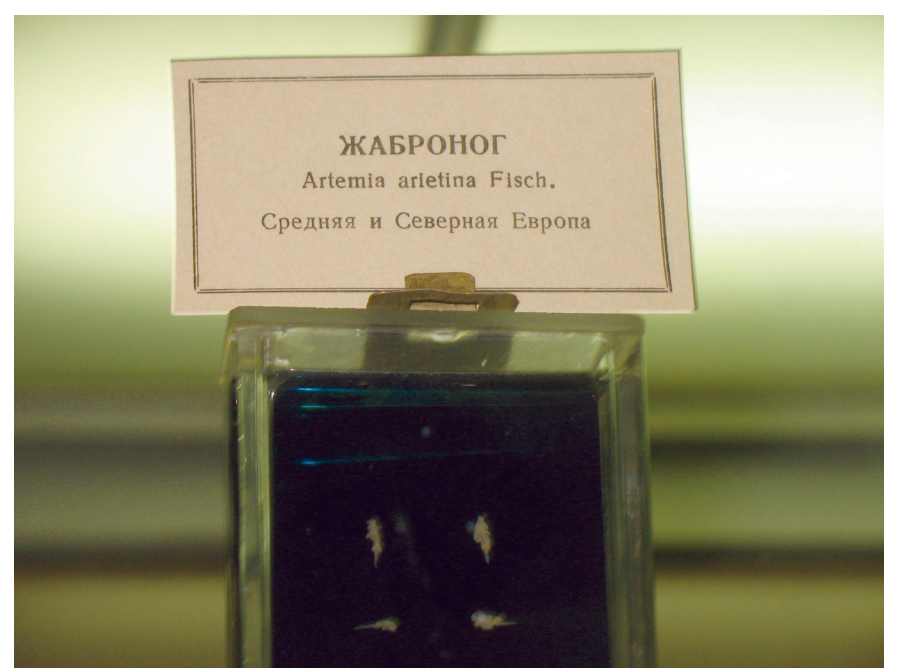
Fig. 6 The original organisms indicated by Kulagin as Artemia arietina. Museum of the Marine Biology Station of Karadag (the Crimea).

Mulhausinii and A. parthenogenetica - A. urmiana found in the present study. These last two species have been described after the Kulagin's publication, but the Authors of these descriptions did not refer to his report. However the things went, an interesting datum is that the Crimea is unique, as regarding the Artemia spp presence, due to the fact that in a relatively small territory, salt lakes host at least three different Artemia species. Artemia shrimps of bisexual and parthenogenetic populations have been found co-existing in 2 out of 84 sites in Countries of the former Soviet Union (reported in MURA and NAGORSKAYA, 2005). Both these two cases were reported from the Crimea (Sasik Sivash, Saki), but in any case the bisexual population has been recorded as A. salina .