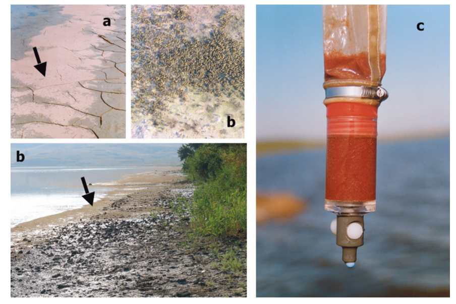
Fig. 1 Examples of crowding populations of just one species in salt lakes. a) pink coloration of a lake shoreline due to Artemia cysts accumulated by wind, Koyashskoe lake. b) brown coloration of shoreline (also in detail) due to a massive presence of the dipteran Ephydra , Tobechicskoe lake. c) red water collected with a plankton net, due to the massive presence of the copepod Arctodiaptomus salinus , Kirkoyashskoe lake.

As a consequence of the low biodiversity, generally a short trophic chain is typical of hyperhaline lakes, with single species in each of not more than 2-3 ecological roles (WHARTON, 2002). The absence of complex ecological networks and the short trophic chains lead to the periodical outbursts of monospecific populations which face limits just in their same numbers (Fig. 1).