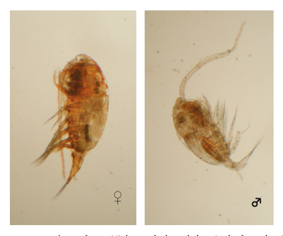
Fig. 3. Arctodiaptomus salinus from Kirkoyashskoe lake. Left, female; Right, male.

The athalassohaline lakes were characterized and dominated by Calanoida Diaptomidae and Insecta Notonectidae. The dominant species was Arcto-diaptomus salinus (Fig. 3) a copepod typical of salt lakes. Its populations showed generations with adults very different in size, often co-existing. This problem induced a misunderstanding identification of one of the different morphotypes as a different species (LITVINCHUCK et al. , 2007).