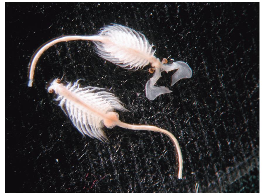
Fig. 4. Artemia urmiana from lake Koyashskoe. Up, male; down, female.

The most of thalassohaline lakes hosted an asexual form of Artemia ( A. parthenogenetica ), but in the Aktashskoye lake the bisexual A. salina , and in the Koyashskoye lake the bisexual A. urmiana have been found. The last species was never been reported outside of its original site (lake Urmia, Iran) before the present survey. As a consequence, the record of A. urmiana from Koyashskoye lake is the first record of the species in Europe (ABATZOPOULOS et al. , 2009) (Fig. 4). Even if the lake Urmia is situated at 1280 m above the sea level, it has been classified as thalassohaline in consequence of its salt quality content (EIMANIFAR and MOHEBBI, 2007).