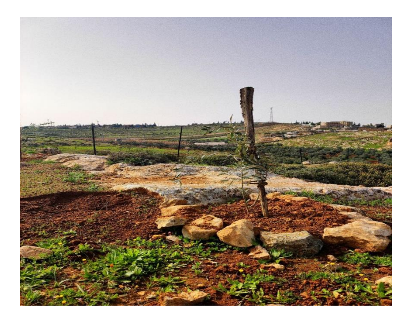
Figure 5 – New Olive Tree Planted in Al-Majaz to revitalize an area brutalized by the settlers living on the settlement on the top right side of the picture.

is precisely that of uprooting the olive trees<sup>9</sup> (Salih and Corry 2022). The roots of the olive trees do not dig deep in the ground, but they spread horizontally, making these trees a concrete example of resistance and more challenging to uproot. Similarly, growing almonds is a long-term commitment. Almond trees (Figure 6) are generally productive for 25 years and produce their first crop three years after planting. Indigenous peoples who know they have a right to experience the land, given the presence of an ancestral relationship with the motherland, are not afraid of the menace of time. They do not follow the dictates of the market. However, the rules of the natural succession of the seasons and this way, these communities perform an eco-resistance embedded in traditional and Indigenous ways of living the land and their relationship with it.