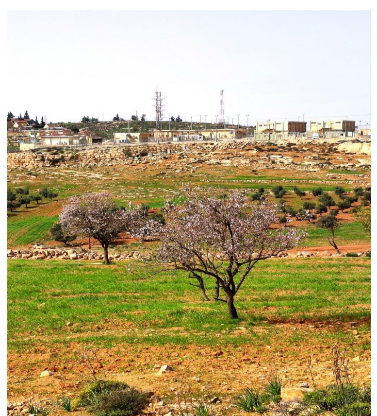
Figure 6 – Checkpoint on the southern border behind some Palestinian almond trees

Settlers striving to colonize the area mainly target the trees, the animals, and the land, and this is not by chance. This is a way to uproot and erase not only the Palestinian Indigenous presence in the land but also Palestinian relation with the land, which is what defines Indigenous identity (Pinson, 2020). Again, the capacity to resist these attacks through an active sumud that constantly reiterates and reaffirms the Palestinian presence on the land makes it a type of eco-resistance that continuously passes through the land, the plants, the animals, and the whole ecosystem. Indigenous eco-resistance against settler colonialism is instrumental in defining settler colonialism as a dynamic process rather than a fixed structure. This dynamic nature stems from the perpetual need for settler colonialism to reinvent itself and devise novel strategies on different levels of action to obliterate Indigenous communities. How a settler population establishes itself can manifest in diverse forms, yet it invariably operates through the structures elucidated in the existing literature. Nevertheless, acknowledging this does not negate indigenous identity, particularly in the context of resistance. It is in relation to Indigenous resistance that colonial structures undergo transformations and seek to extend their control.