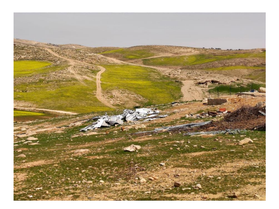
Figure 1 – Recently Demolished House in Masafer Yatta

capitalist ethos, where the protracted gestation period for specific trees and plants aligns incongruently with the expeditious demands of international trade.