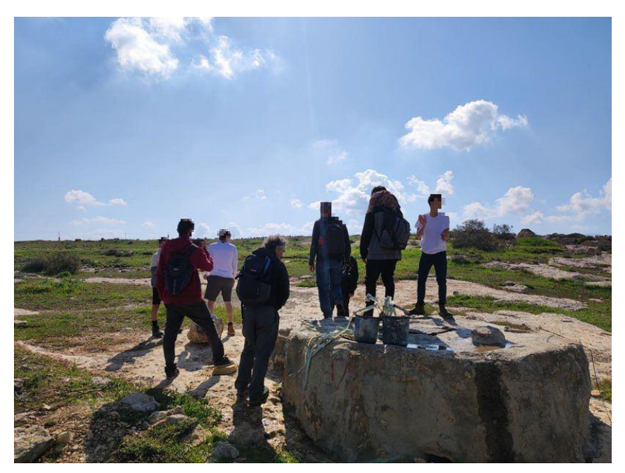
Figure 4 – Settlers Vandalizing a Palestinian Cistern

Beyond the established legal framework, a pervasive aspect of daily life involves interactions that underscore the centrality of water-related concerns. During my fieldwork, I observed a provocative incident wherein settlers deliberately attacked and squandered water from one of Susiya's cisterns, as depicted in Figure 4.