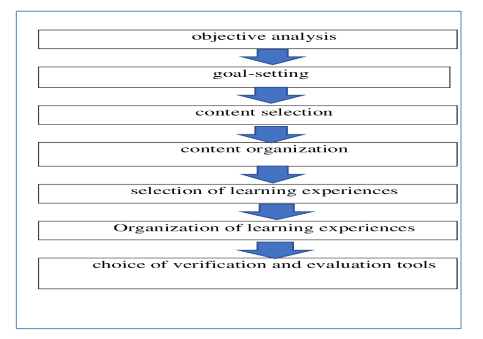
Figure 1: Curricular design according to the Taba model (1962)