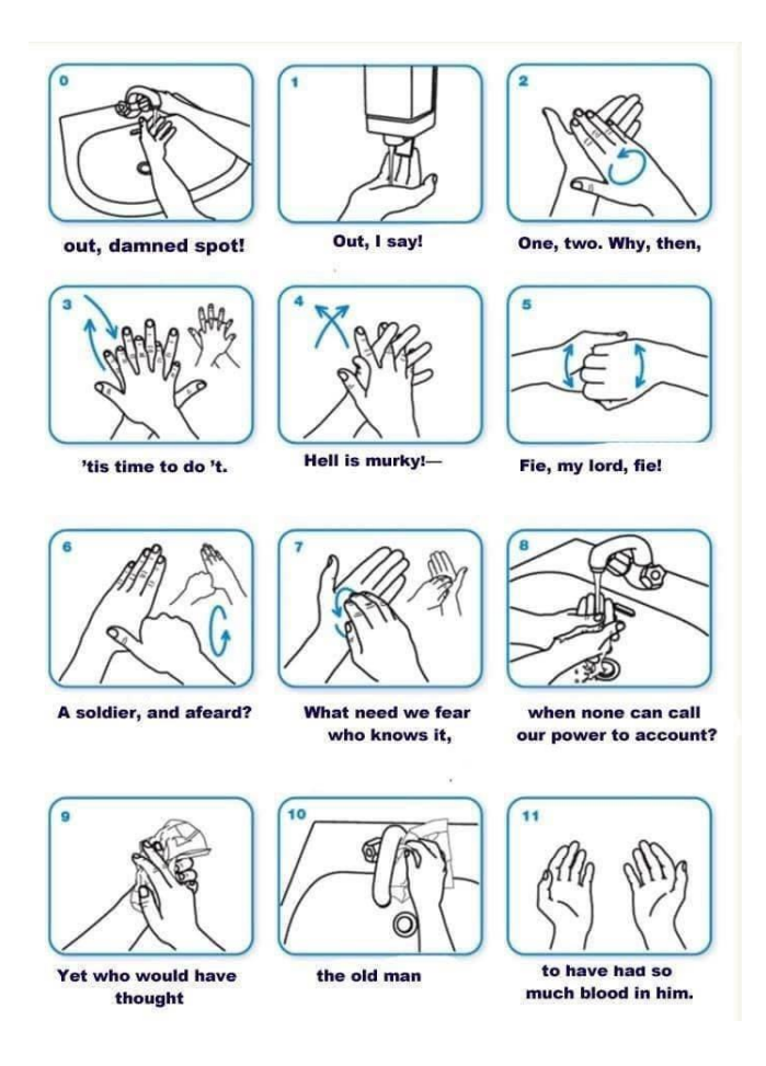
Figure 2 Lady Macbeth's washing hands internet meme.

"To Meme or not to Meme", and to do so during a pandemic. Shakespeare and the Memetic Transmission of a Classic