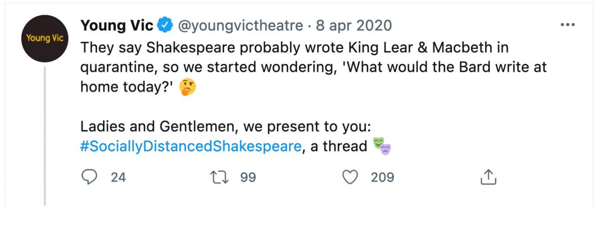
Figure 5 Young Vic's tweet.

From the same profile, a series of ironic elaborations of contemporary 'Shakespearean' plays was published: