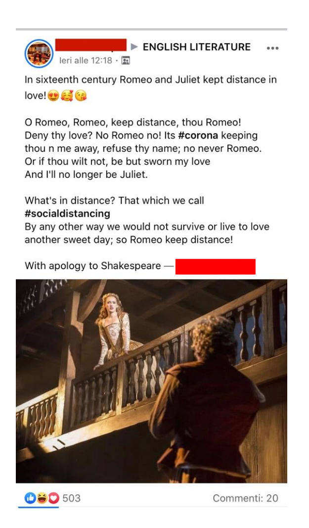
Figure 4 A Shakespearean meme for a niche audience.