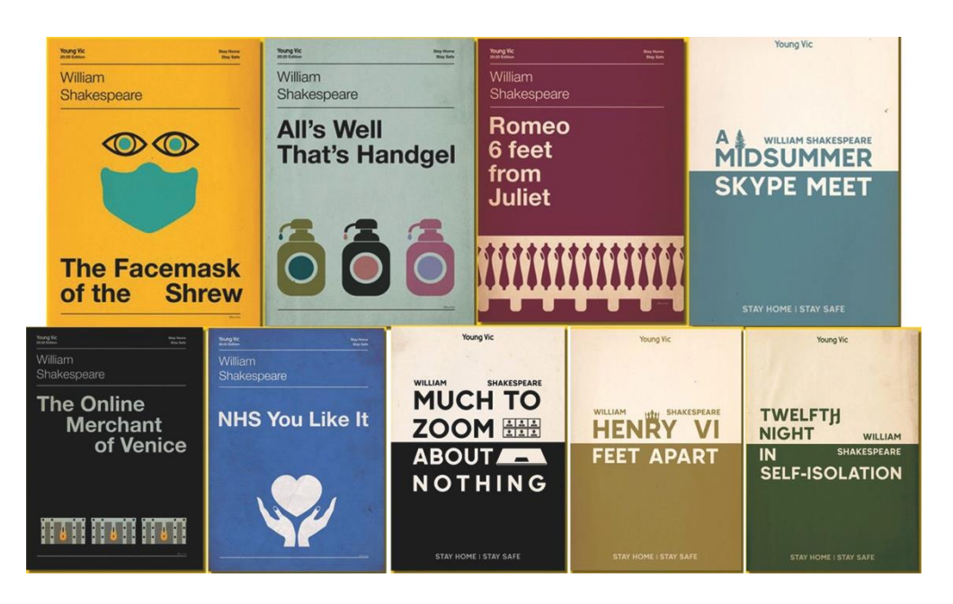
Figure 6 Young Vic's Socially distanced Shakespeare.

From the same profile, a series of ironic elaborations of contemporary 'Shakespearean' plays was published: