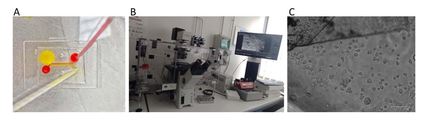
Fig.1. A) Foto del dispositivo sottoposto a test di flusso con Elve flow OB1MK3 con coloranti alimentari (rosso e giallo). B) Foto del sistema incubatore (Okolab)+ microscopio dove è stato tenuto in coltura per 3 giorni il dispositivo con all'interno cellule umane di adenocarcinoma al colon-retto (Caco-2). C) Immagine presa dal microscopio Evos Floid Invitrogen delle cellule Caco-2 appena seminate nel chip (scale bar:125 μm)